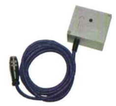
TRI-AXIAL GEOPHONE SENSOR UNIT

Please see our website www.accudata.co.uk for full details