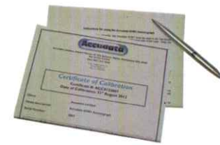
CALIBRATION CERTIFICATE & USER INSTRUCTIONS