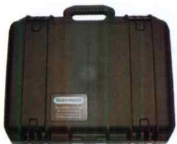
HIGH QUALITY WEATHERPROOF CASE