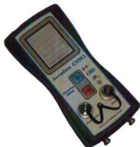
THE ACCUDATA GVM-1 STORES 500 EVENTS ON SD CARD