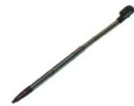
TOUCH SCREEN STYLUS